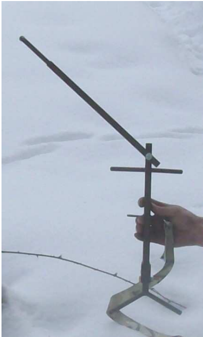
(Step #1) Extend rotating arm