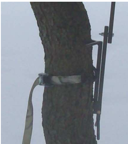
(Step #3) pull strap tight to snug hanger against tree