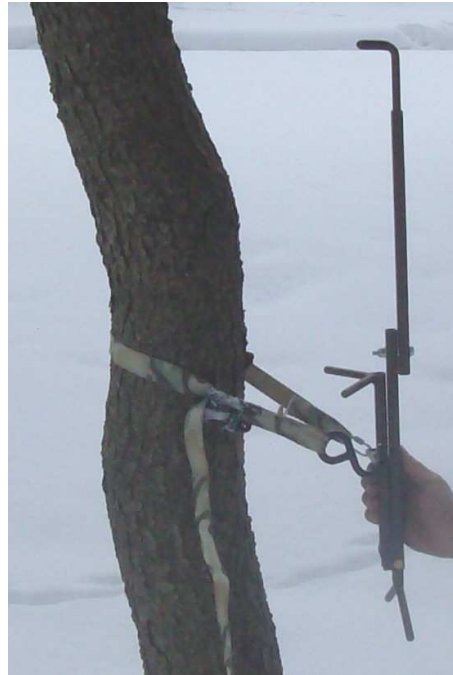
(Step #2) Wrap strap around tree and hook into eyelet