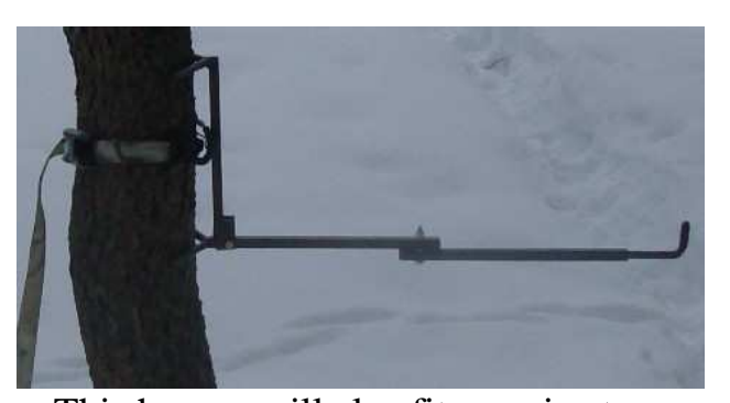
This hanger will also fit any size tree.