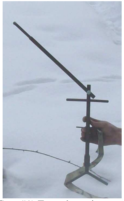
(Step #1) Extend rotating arm