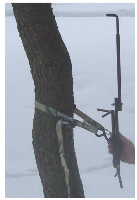
(Step #2) Wrap strap around tree and hook into eyelet