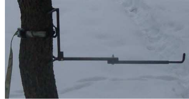
Unlike Screw-in style hangers this hanger Will not twist out if something heavier (like a gun) is hung from the side. It is locked and secure.