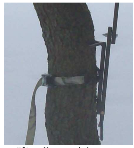
(Step #3) pull strap tight to snug hanger against tree